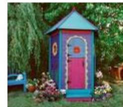
Permit not required

Zoning permits are required regardless of structure size. Contact the Zoning Administrator at (540) 375-3032 for setback and easement requirements. No buildings shall be placed in a flood plain.